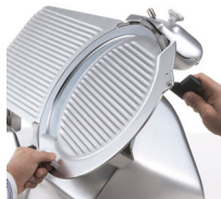
Easily removable blade cover