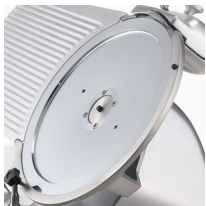
Blade hub closed, without tie rod cover blade